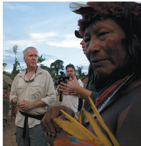
James Cameron visits the Xingu

two judicial actions in 2010 against IBAMA for having granted the provisional environmental license without responding to the omissions in Eletrobras’ environmental assessment. The judicial actions argue that the missing water quality data violates National Environmental Council (CONAMA) Resolution 357, which establishes the standards for water quality, and article 176 of the Brazilian Federal Constitution, which prohibits the development of hydrological energy potential on