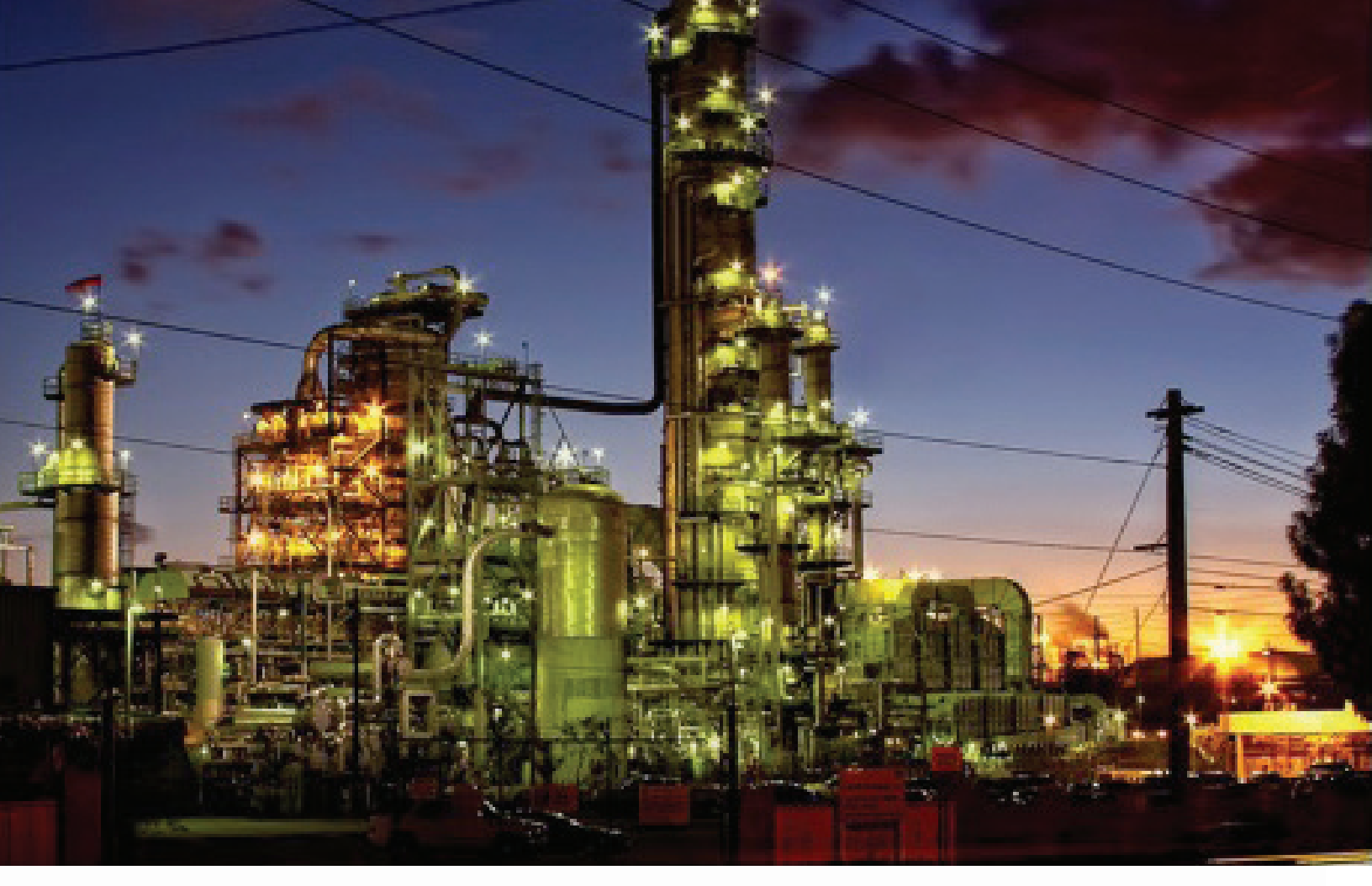
Chevron's El Segundo Refinery, which processes an average of 56,463 barrels of Amazon crude oil every day. While Chevron blames PetroEcuador for its own contamination in the northern Ecuadorian Amazon, its El Segundo refinery is by far the largest non-Ecuadorian refiner of that company's crude.