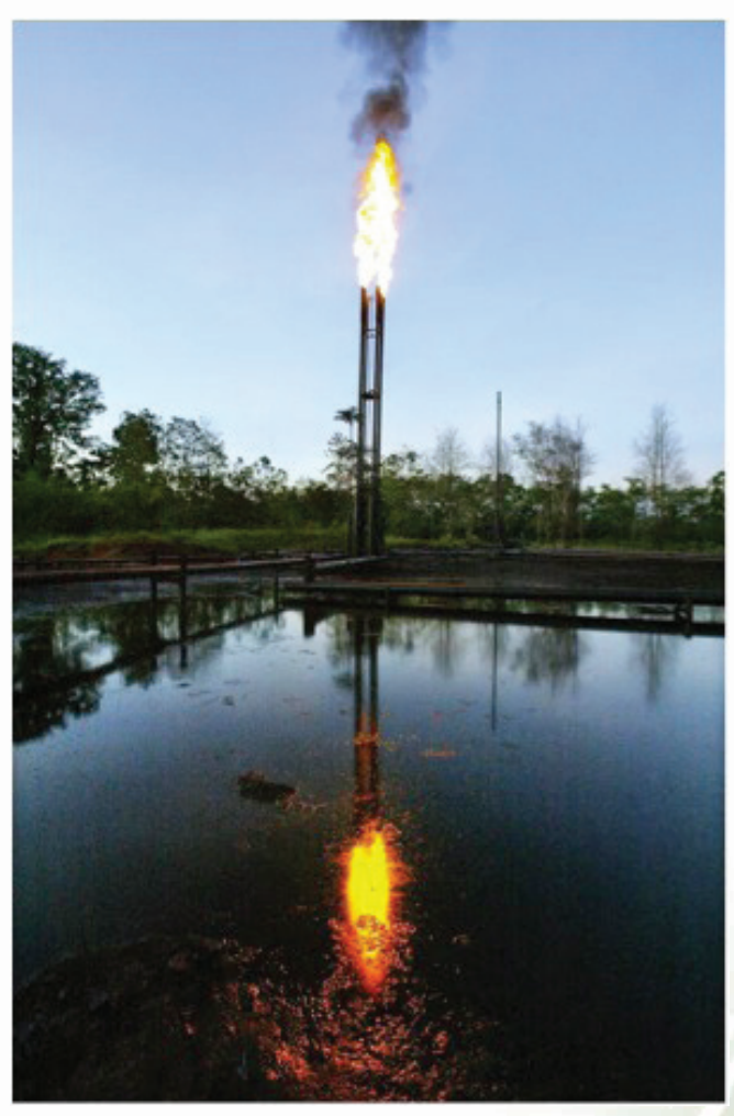
A Petroecuador separation station in Ecuador's northern Amazon rainforest.

In addition, this high-stakes and high-risk business environment has allowed corruption to thrive. China buys nearly all of Ecuador's oil and then resells it to corrupt Ecuadorian oil insiders, who then sell it on the open market at a markup. Private traders then sell the oil to refineries, with most of it going to California. An investigative report based on the Panama Papers showed that two of those middlemen managed to skim $1 off the top of every barrel of oil sold, earning a handsome $70 million "commission." Shell companies and offshore accounts were used to hide the paper trail and the money. These are the same middlemen who received tens of millions in inflated contracts and kickbacks from Petroecuador, a revelation that led to a prison sentence for the company's head and the forced resignation of the country's Hydrocarbons Minister.24