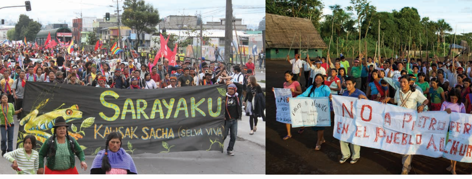
Sarayaku marches during the national mobilization for water rights in Quito, Ecuador, 2010.