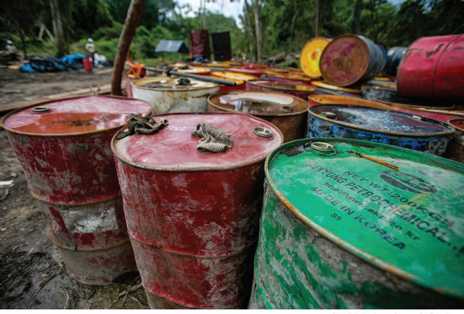
Barrels filled with crude waste after a recent PetroPeru spill.