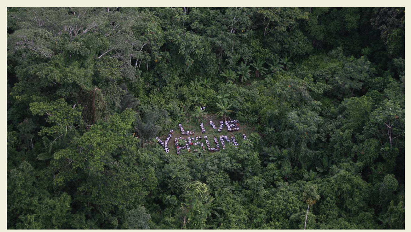
Human banner inside Yasuní National Park to promote the Yasuní-ITT initiative, 2007.