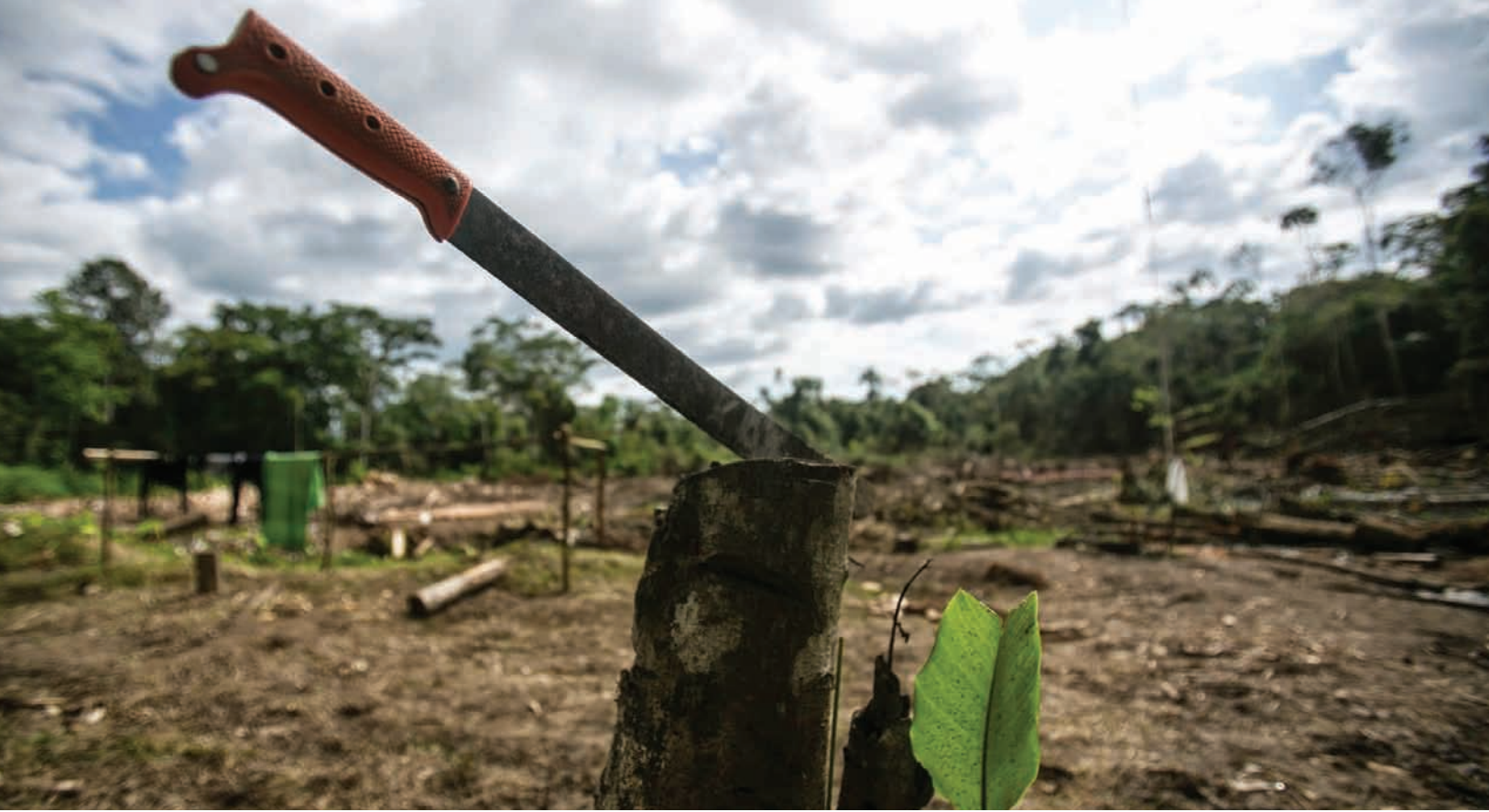
Deforestation from oil spill remediation efforts in the Peruvian Amazon.